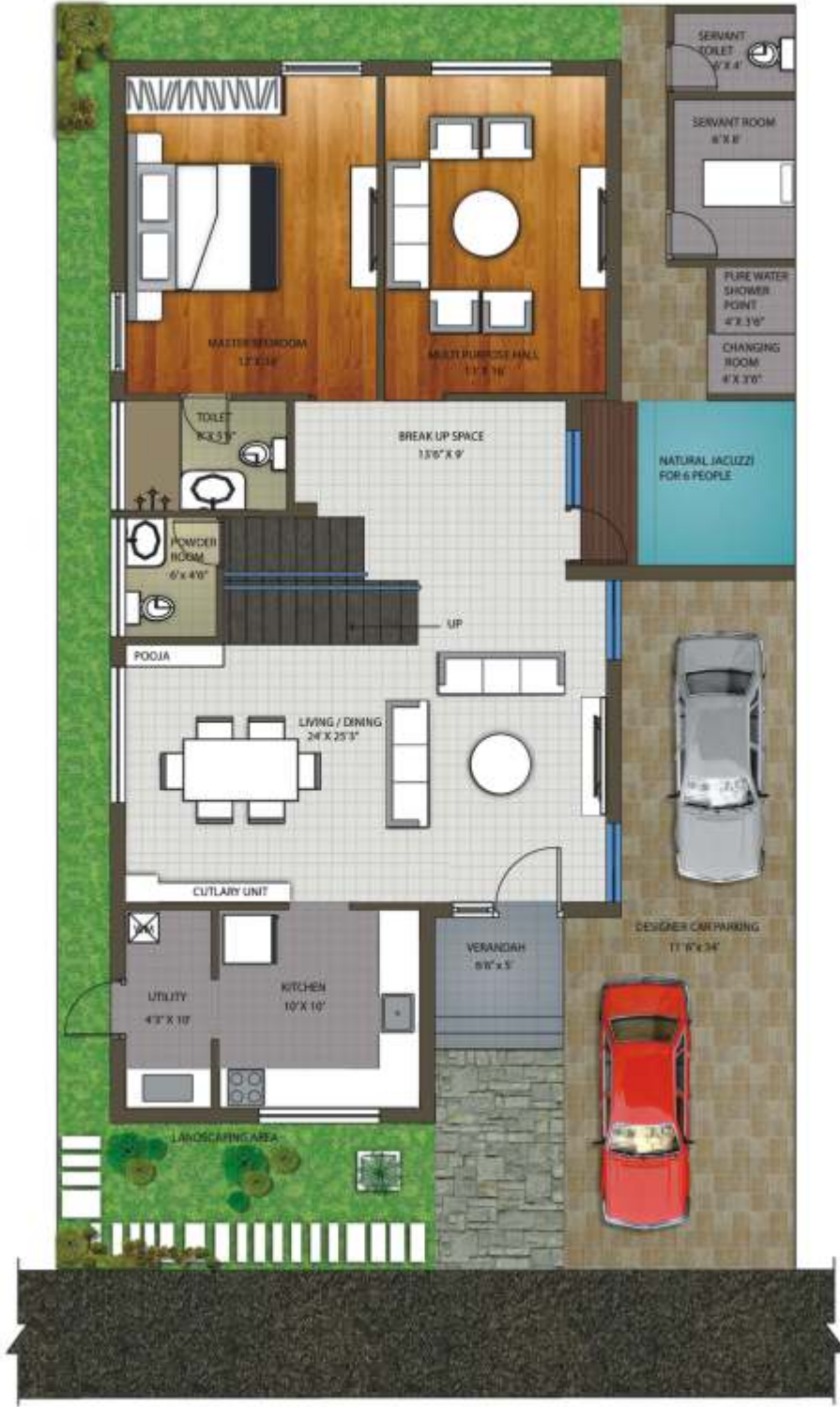
EAST FACING VILLA TYPE-1