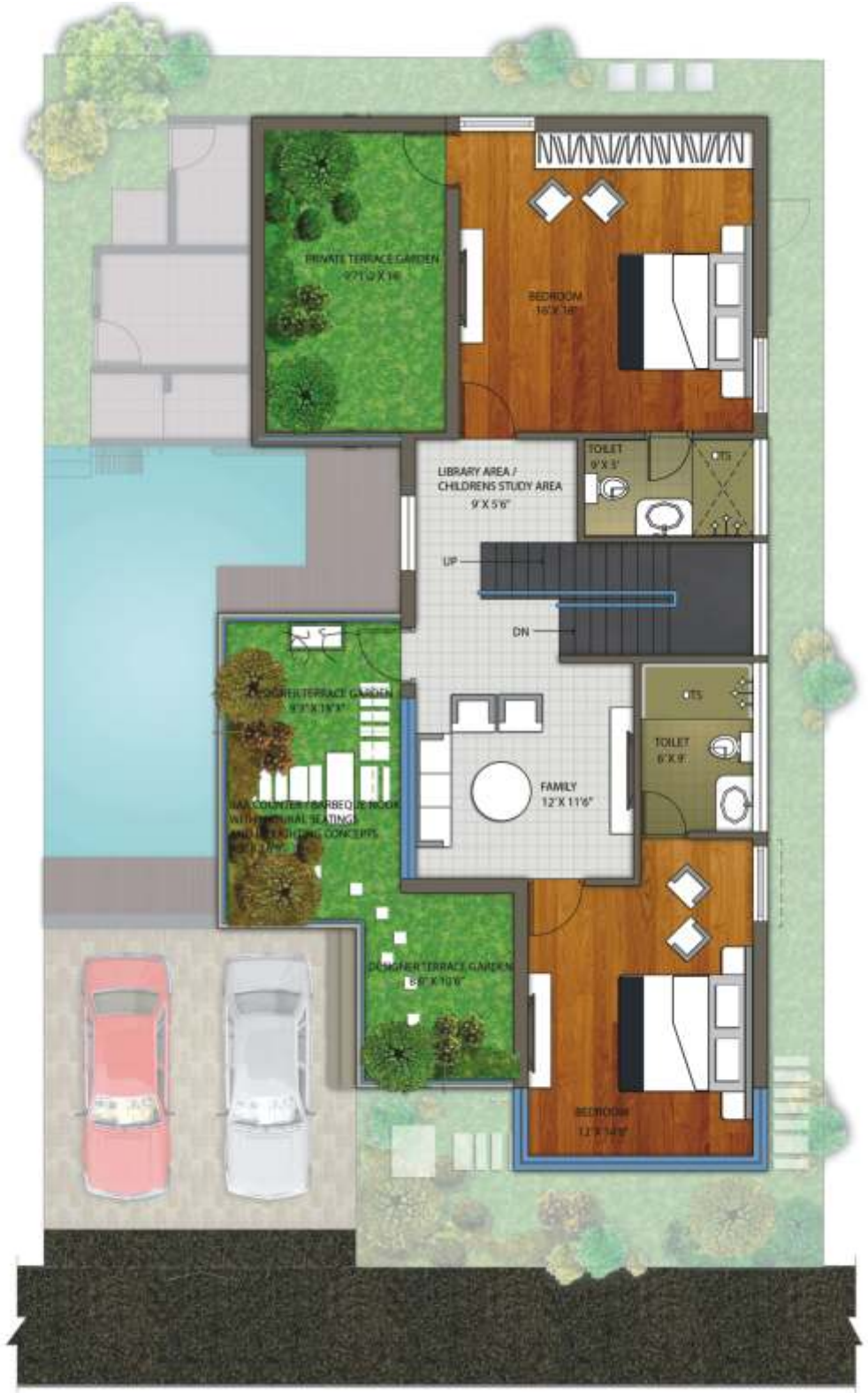
WEST FACING VILLA