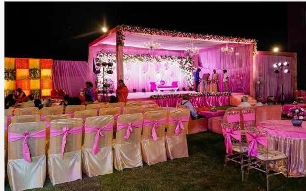
Open terrace party lawn