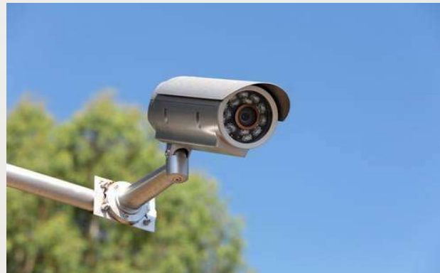
CCTV for common Area