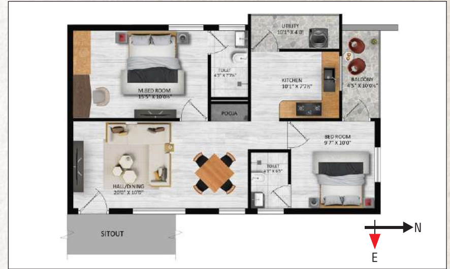
EAST FACING FLAT