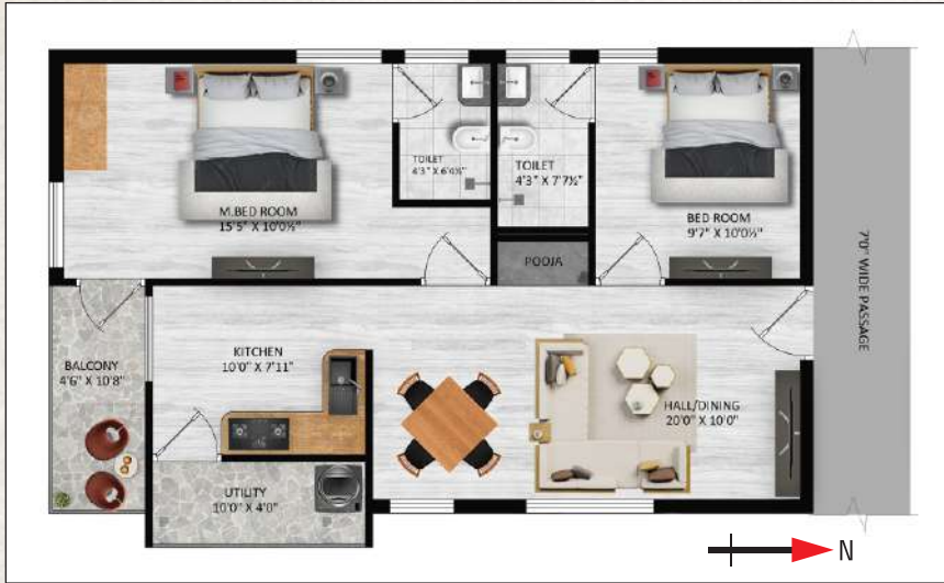
NORTH FACING FLAT